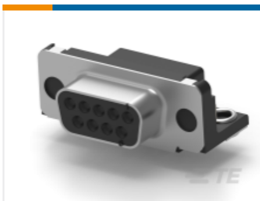
TE Part # CAT-023-DRARS1274 D-Sub Receptacle Assembly: Right Angle, Shell Size 1, 2.74mm