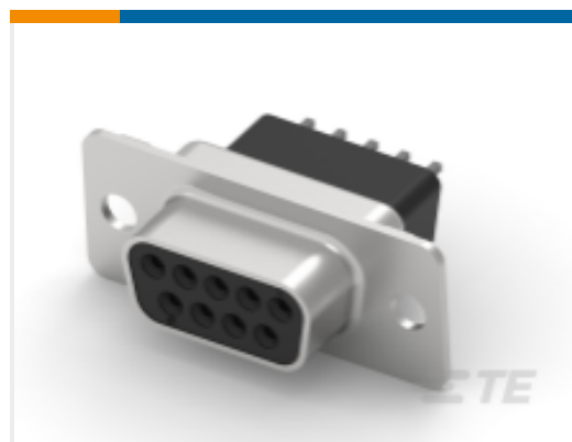
TE Part # CAT-025-DRAVS1274 D-Sub Receptacle Assembly: Vertical, Shell Size 1, 2.74mm