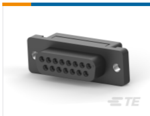
TE Part # CAT-AM7-253 IDC D-Sub: Receptacle Assembly, Low Profile, Signal, 2.77 mm